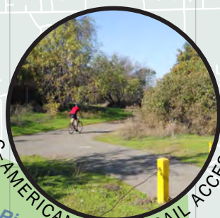
C-AMERICAN RIVER TRAIL ACCESS