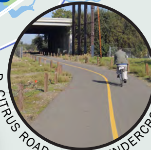
D-CITRUS ROAD HWY 50 UNDERCROSSING