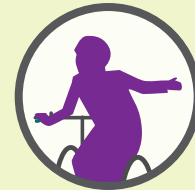
ALTERNATE RIGHT TURN