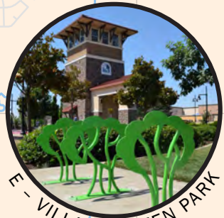
E-VILLAGE GREEN PARK