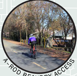
A-ROD BEAUDRY ACCESS