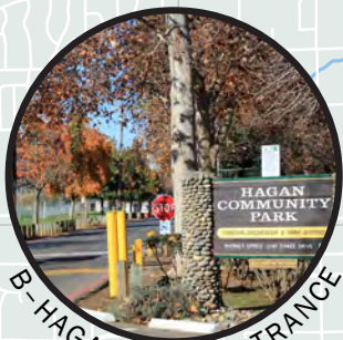
B-HAGAN PARK ENTRANCE