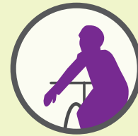
SLOW OR STOP