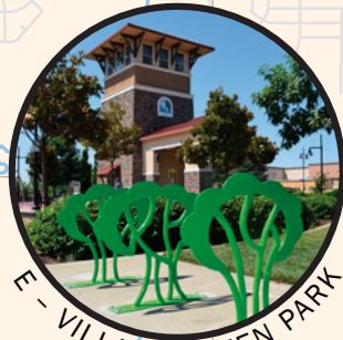
E-VILLAGE GREEN PARK