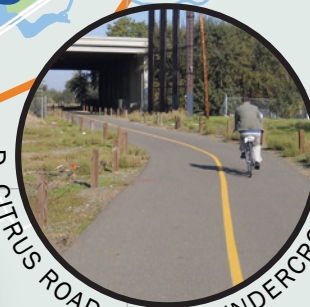
D-CITRUS ROAD HWY 50 UNDERCROSSING