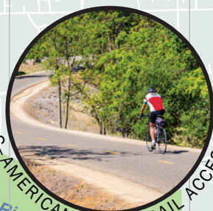
C-AMERICAN RIVER TRAIL ACCESS