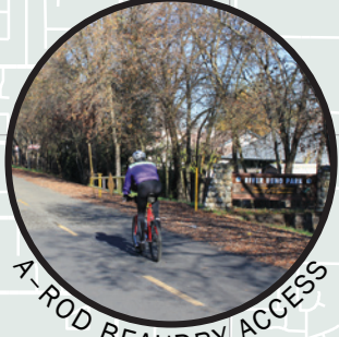
A-ROD BEAUDRY ACCESS