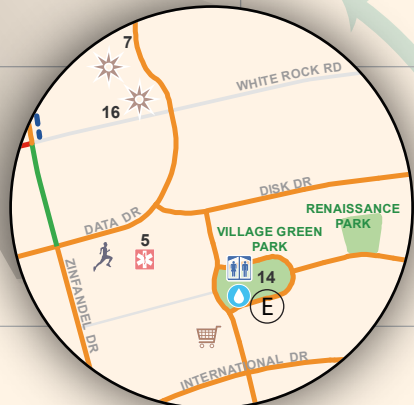
ANTICIPATED TRAIL SYSTEM