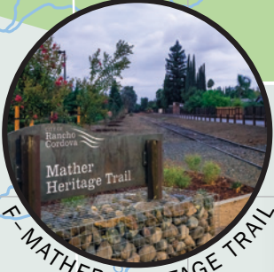
F-MATHER HERITAGE TRAIL