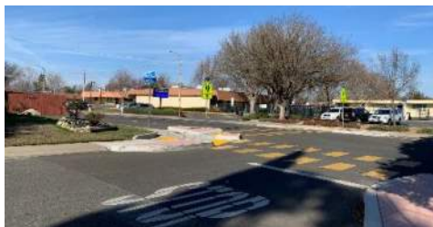
Example Materials (Similar to Benita Drive at Sonata Drive)