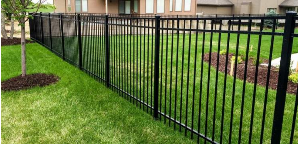
Example Material: Black Powdercoated Tubular Steel Fencing