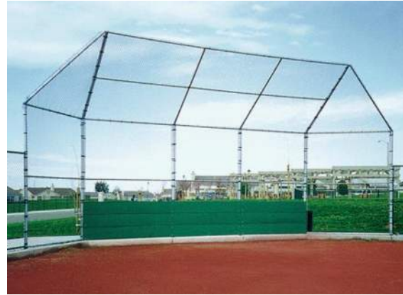
Farm & T-ball - 20' hooded