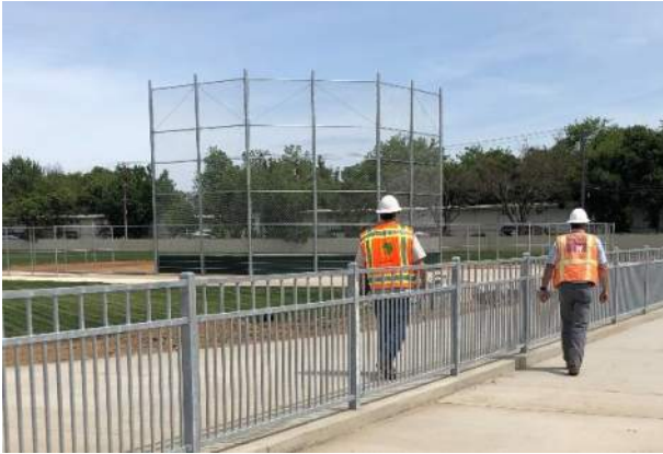
Major/Minor Fields - 30' Non-Hooded