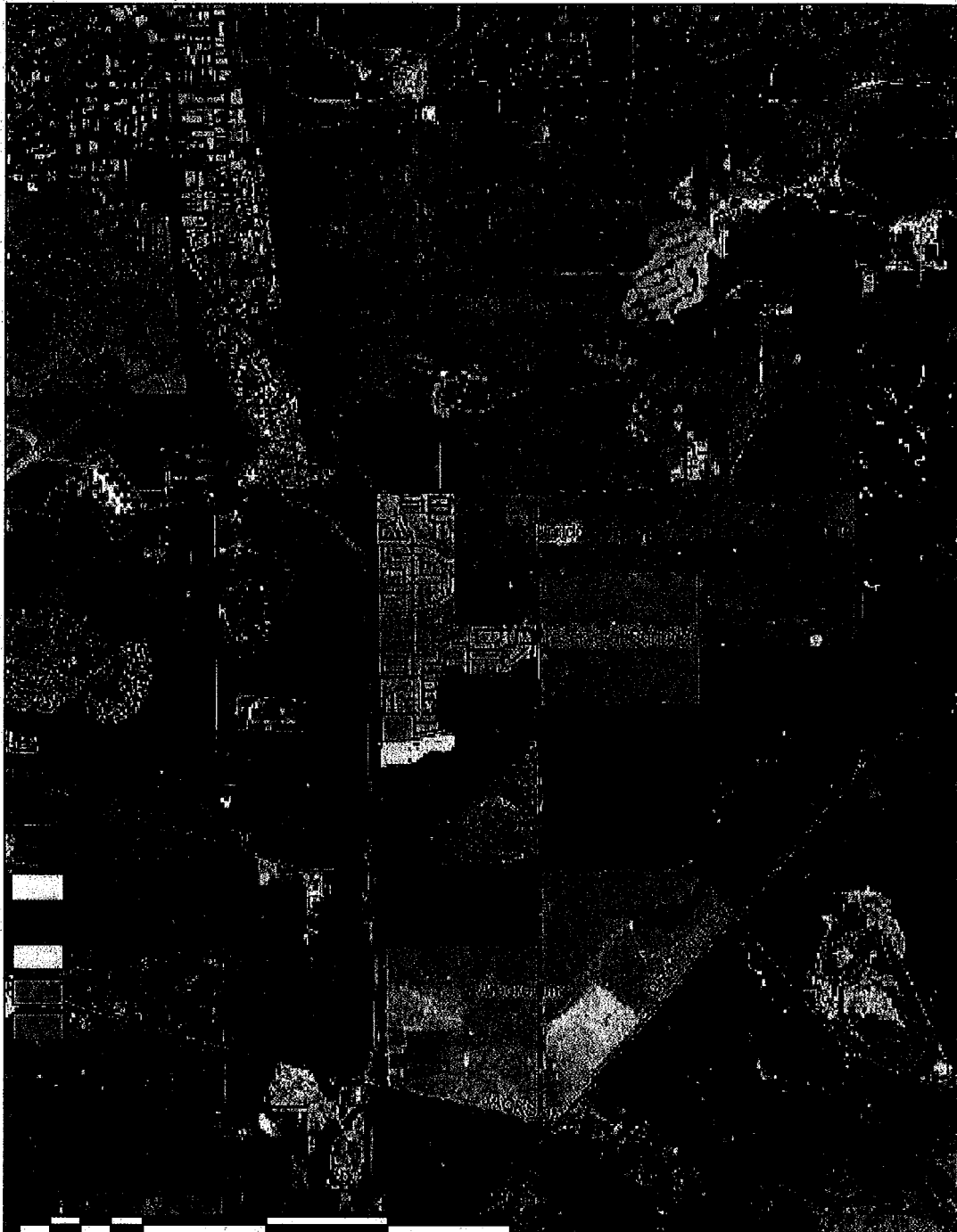
Figure 2 SunCreek Project Boundary