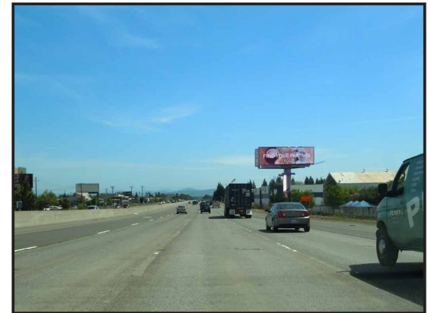
After: 14' x 48' Digital