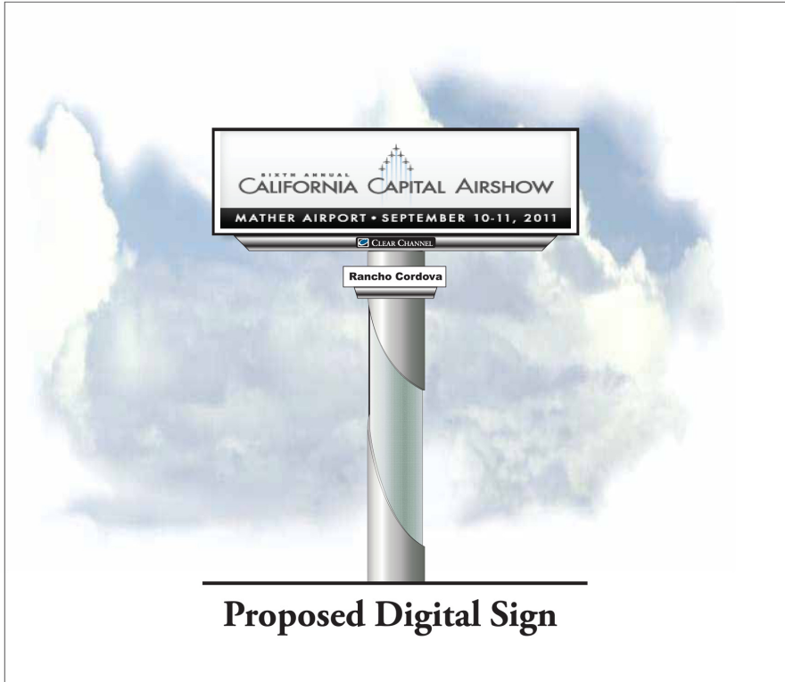
Proposed Digital Sign