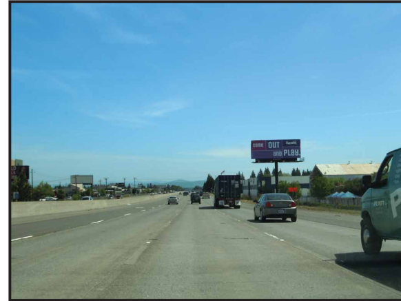
Before: 18' x 48' Traditional